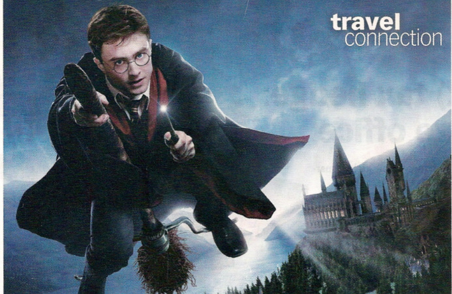
© 2010 UNIVERSAL ORLANDO RESORT. ALL RIGHTS RESERVED.