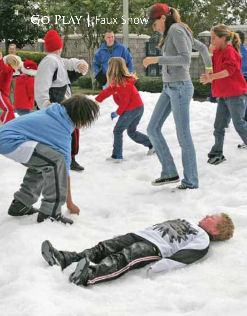
Kids enjoy manufactured snow at RDV Sportsplex's Snow Fest event in Maitland.