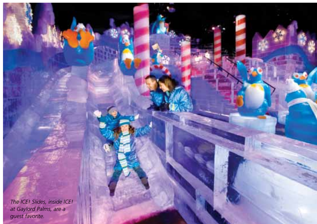
The ICE! Slides, inside ICE! at Gaylord Palms, are a guest favorite.

Consider Gaylord Palms as your place for the ultimate "Christmas-crawl." Frolic with the family for hours as you explore the resort — dexterously decked out in holiday décor, complete with a 54-foot Christmas tree. Catch one of four live shows on stage at the Emerald Plaza, visit Santa, and don't miss our favorite way to occupy the family — the Hidden Holiday Gnome Hunt. Your trek will culminate at ICE! at Gaylord Palms , where you and your gang brave the 9-degree temperatures in signature hooded parkas as you traverse wintry scenes guaranteed to take your frosty breath away. With more than 2 million pounds of ice packed into a 100-acre winter wonderland, ICE! certainly is the North Pole of Central Florida. www.gaylordhotels.com/gaylord-palms